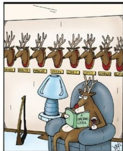
All of the other reindeer used to laugh and call him names.