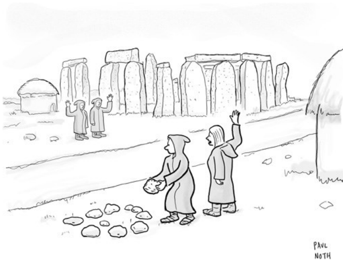
"How can we possibly compete with their solstice decorations?"

If you plan on coming please make your payment at least three days in advance here: http://www.palmettobrush.com/services.html